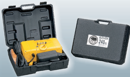
▲ Hoist packed in convenient molded carrying case with built-in handle.